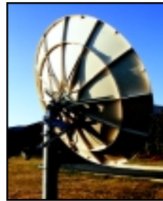
Back View Series 1253

Prodelin Corporation is the world's largest manufacturer of Rx/Tx VSAT antennas. We have the broadest product line in the industry including Receive Only, Rx/Tx and Rural Telephony antenna systems. Prodelin offers nineteen antenna sizes, 47cm to 4.5M. Prodelin is the leader in obtaining type certifications and approvals for Intelsat, AsiaSat and Eutelsat. Prodelin antennas provide the best quality in the market due to the sophisticated, precision SMC compression molding process technology. Prodelin provides the best value antenna solution to the market with competitive prices, the highest quality products and superb engineering support. Prodelin is ISO registered, KEMA # 70022.01. Prodelin - The Market Leader in VSAT Antennas.