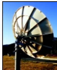
Back View Series 1253

Prodelin Corporation is the world's largest manufacturer of Rx/Tx VSAT antennas. We have the broadest product line in the industry including Receive Only, Rx/Tx and Rural Telephony antenna systems. Prodelin offers nineteen antenna sizes, 47cm to 4.5M. Prodelin is the leader in obtaining type certifications and approvals for Intelsat, AsiaSat and Eutelsat. Prodelin antennas provide the best quality in the market due to the sophisticated, precision SMC compression molding process technology. Prodelin provides the best value antenna solution to the market with competitive prices, the highest quality products and superb engineering support. Prodelin is ISO registered, KEMA # 70022.01. Prodelin - The Market Leader in VSAT Antennas.