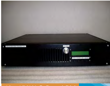
40 - 150W C-Band RM