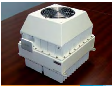
80 - 125W C-Band