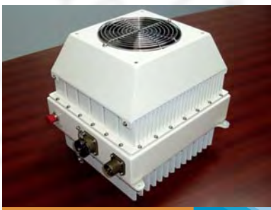
40 - 60W Ku-Band