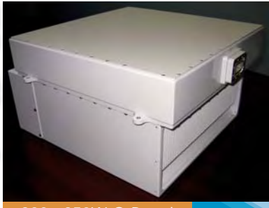
200 - 250W C-Band