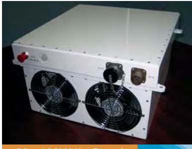
80 - 100W Ku-Band