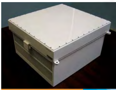
80 - 100W Ku-Band