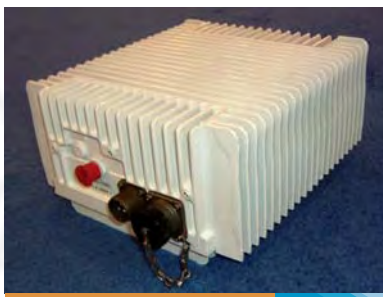
10 - 16W Ku-Band