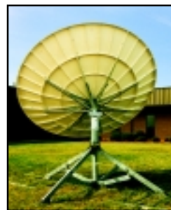
Back View Series 1374

Prodelin Corporation is the world's largest manufacturer of Rx/Tx VSAT antennas. We have the broadest product line in the industry including Receive Only, Rx/Tx and Rural Telephony antenna systems. Prodelin offers nineteen antenna sizes, 47cm to 4.5M. Prodelin is the leader in obtaining type certifications and approvals for Intelsat, AsiaSat and Eutelsat. Prodelin antennas provide the best quality in the market due to the sophisticated, precision SMC compression molding process technology. Prodelin provides the best value antenna solution to the market with competitive prices, the highest quality products and superb engineering support. Prodelin is ISO registered, KEMA # 70022.01. Prodelin - The Market Leader in VSAT Antennas.