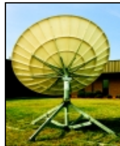
Back View Series 1374

Prodelin Corporation is the world's largest manufacturer of Rx/Tx VSAT antennas. We have the broadest product line in the industry including Receive Only, Rx/Tx and Rural Telephony antenna systems. Prodelin offers nineteen antenna sizes, 47cm to 4.5M. Prodelin is the leader in obtaining type certifications and approvals for Intelsat, AsiaSat and Eutelsat. Prodelin antennas provide the best quality in the market due to the sophisticated, precision SMC compression molding process technology. Prodelin provides the best value antenna solution to the market with competitive prices, the highest quality products and superb engineering support. Prodelin is ISO registered, KEMA # 70022.01. Prodelin - The Market Leader in VSAT Antennas.