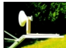
Option Ku-Band Feed