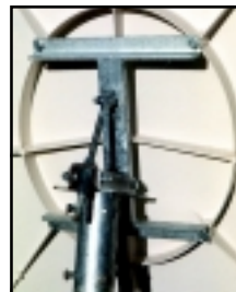
Back View Series 1125