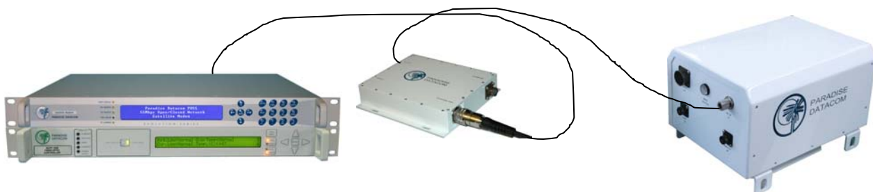
PD25 SATELLITE MODEM (top) RCPF-1000 FIBER-OPTIC CONTROLLER

A system utilizing a Fiber Optic link can have an IFL length in excess of 1km. An optical link is also desirable in areas in which L-Band interference can degrade the system's performance.