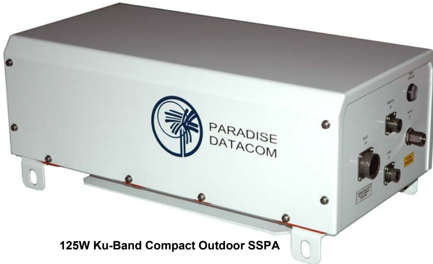
125W Ku-Band Compact Outdoor SSPA