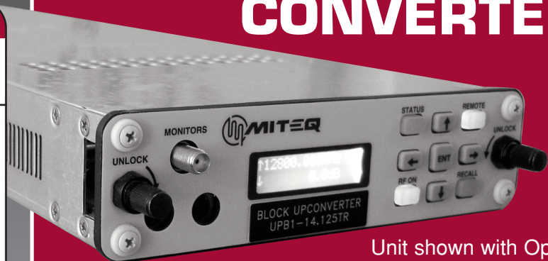
Unit shown with Option 17

This equipment is designed for applications where frequency translation is needed between L-band and the transponder frequency.