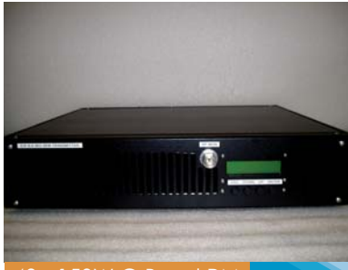
40 - 150W C-Band RM