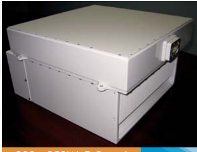
200 - 250W C-Band