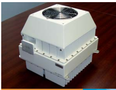
80 - 125W C-Band