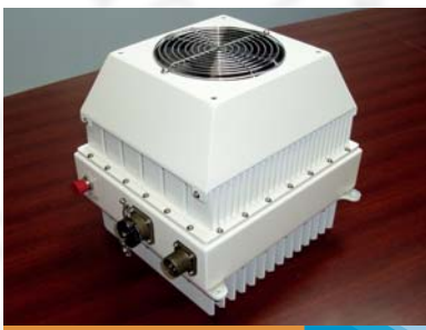
40 - 60W Ku-Band