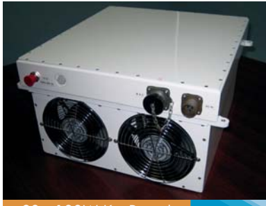
80 - 100W Ku-Band