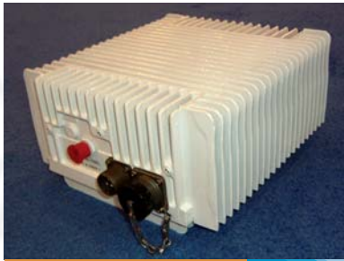
10 - 16W Ku-Band