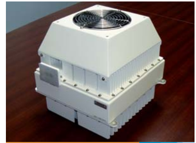
80 - 125W C-Band