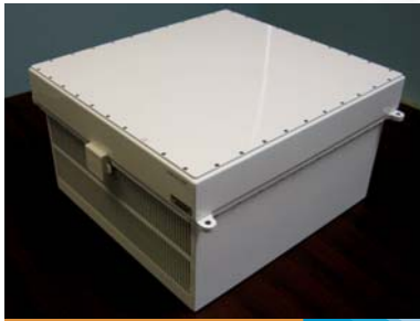
80 - 100W Ku-Band