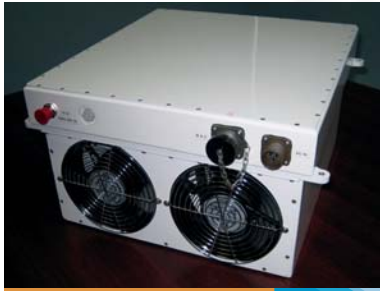
80 - 100W Ku-Band