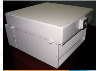
200 - 250W C-Band