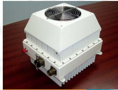
40 - 60W Ku-Band