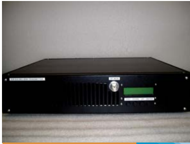
40 - 150W C-Band RM