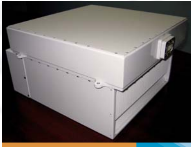
200 - 250W C-Band