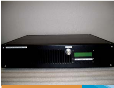
40 - 150W C-Band RM